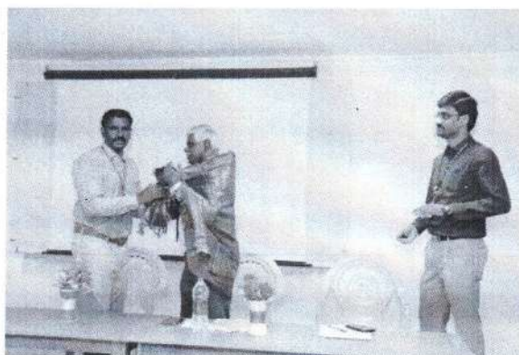
Honoring the Chief Guest and Resource person