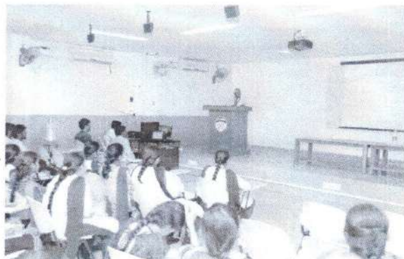
An Overview of the participants

[Signature] 13/09/17 ED Cell Coordinator